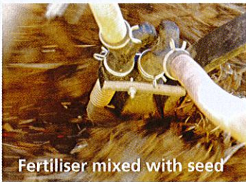
Fertiliser mixed with seed