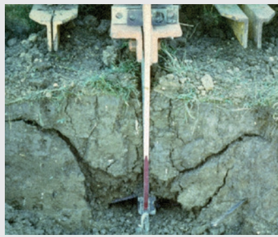
Figure 3. The soil disturbance produced by a tine working below its critical depth (left) and that produced by a winged subsoiler (right)