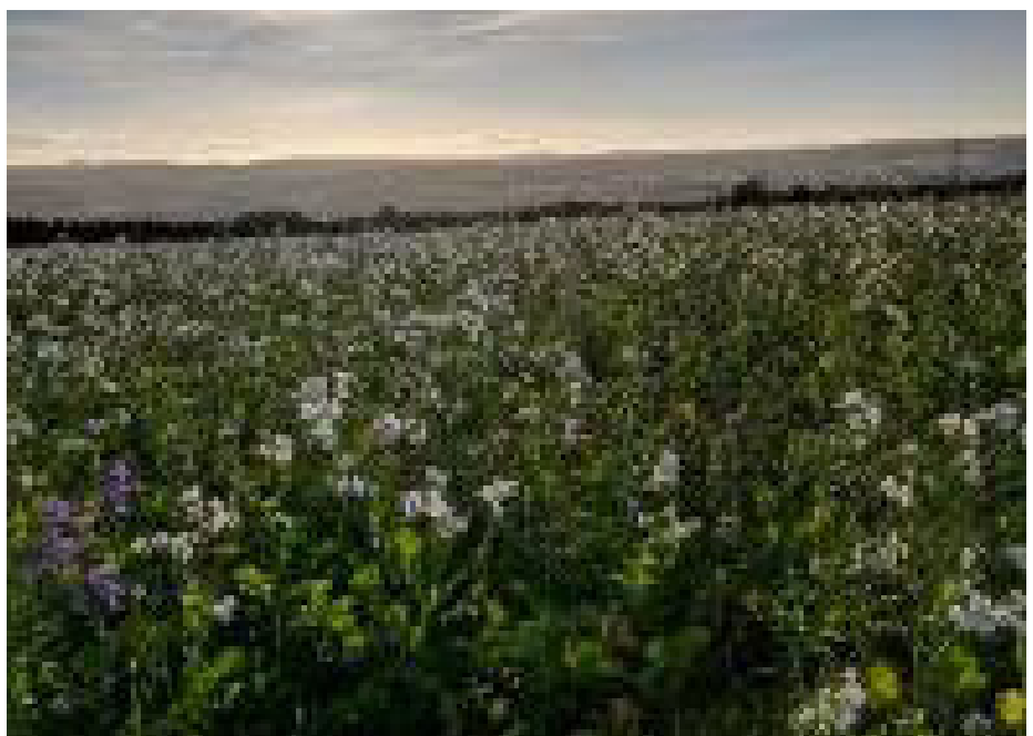
2018 Claydon Crops.