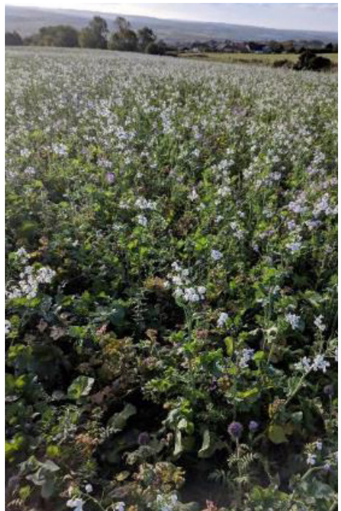
This cover crop, containing phacelia, three varieties of oil radish, oats, barley, buckwheat and vetch, had been drilled on 29 July and was photographed a couple of hours before it was due to be sprayed off midway through October prior to drilling winter beans.