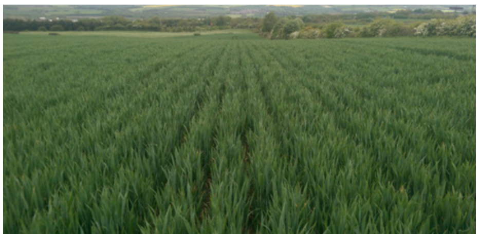
Claydon crops back in 2015.